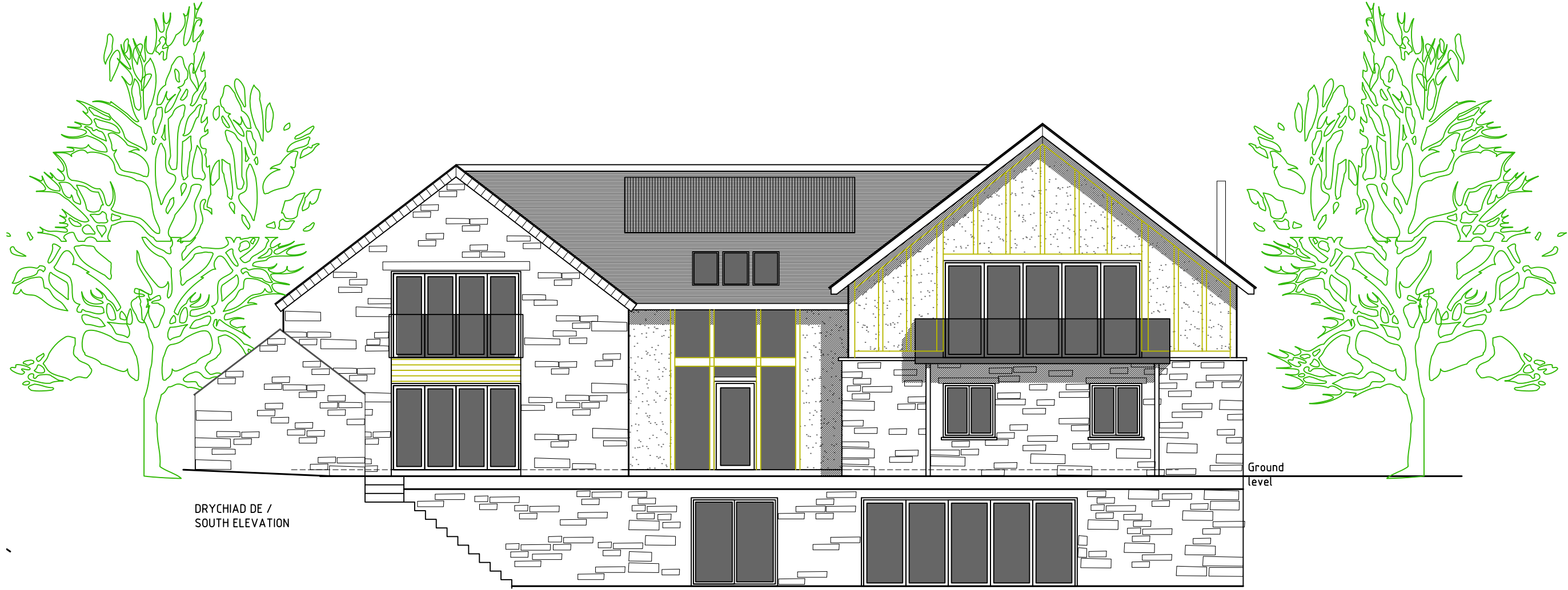
DRYCHIAD DE / SOUTH ELEVATION